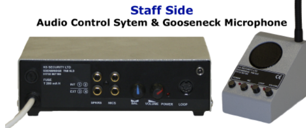
Staff Side Audio Control System & Gooseneck Microphone